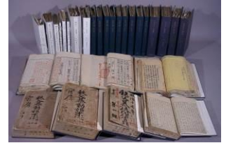
重要文化財「埼玉県行政文書」： Important Cultural Properties (Saitama Prefectural Government Administrative Documents)

Saitama Prefectural administrative documents (public records) reflect the status and administrative developments of Saitama Prefecture over time, and represent highly important cultural heritage items. Since the beginning of the Meiji era, over 200,000 items have been collected and stored at the Saitama Prefectural Archives, and more are added each year. A portion of these materials have also been designated as national Cultural Properties.