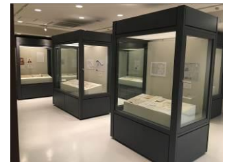
展示室： Exhibition Room

The Archives features various exhibitions on different themes, aiming to showcase administrative documents, ancient texts, maps, and a wide range of other materials in the Archives' collection as well as raise awareness of the activities and appeal of the Prefectural Archives.