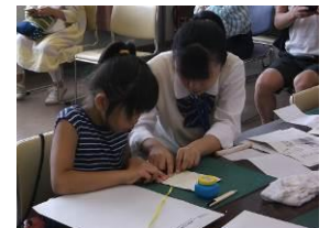
子供体験教室： Practical Workshop for Children (Making Japanese Scrolls)

The Archives accepts requests for social learning workshops, educational personnel training, and by-request instruction, to provide opportunities for collected materials to be used effectively as school teaching materials.