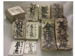
明治期の間真関係帳簿（深谷市飯塚家文書）： Ledgers concerning aidama dyeing materials from the Meiji era (from the Iitzuoka household in Fukaya City)

Ancient texts include items such as books and writings belonging to samurai, shrine and temple supervisors, civil servants, and information on organizations from as far back as the Meiji Restoration. These ancient texts are important materials which outline the history of the Prefecture and local areas. The Saitama Prefectural Archives has a vast collection of these materials, gathered from all areas of the Prefecture dating back to the Kamakura and Muromachi periods.