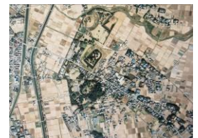
埼玉全県航空写真： Aerial Photograph of the Entire Prefecture 1995, A-16 B-20 (Near the Saitama Ancient Burial Mounds)

Showing the layout of areas within the Prefecture.