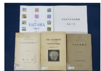
行政刊行物： Government Publications

Alongside administrative documents, publications produced by the Saitama Prefectural Government serve as highly important Prefectural Government-related materials. Approximately 50,000 books, including various kinds of reports, statistical documents, and other materials, have been collected and are available for use. Additionally, documents recounting the histories of principal regional government bodies both in and outside the Prefecture, as well as dictionaries, encyclopedias, magazines, and more, can be used as reference materials.