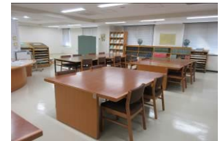
地図閲覧室： Map Viewing Room

In viewing areas you can browse a huge variety of materials related to regional history and culture. Search methods, such as a catalog system and the online search system, are available to help visitors effectively use the information stored in the Archives.