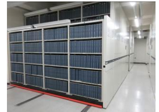
保存庫集密書架： Compact Storage Bookshelves

The facility collects valuable documents and organizes them for viewing and use by visitors. The correct storage and preservation of these materials forms the base of operations at the Prefectural Archives, ensuring that the materials can properly serve as a source of information for the residents of Saitama for years to come.