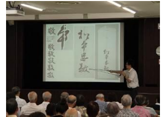
古文書解読講習会： Intensive Course on Understanding Ancient Texts

The Prefectural Government Archives holds classes aimed at deepening participants' understanding of their birthplace of Saitama through deciphering and explaining the materials collected by the Archives. Entry level, beginner, and intermediate classes are available in addition to an intensive course on understanding ancient texts which is held every summer.