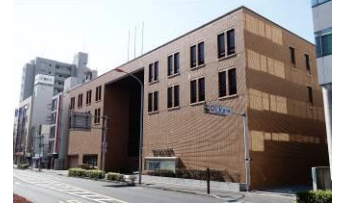
文書館外観： Outside View of the Archives

Saitama Prefectural Archives collects, organizes, and preserves a wide range of documents related to Saitama, including maps, ancient texts, and administrative documents with cultural and historical value. The Archives has been fulfilling this important role since 1969 with the aim of serving as the source of Saitama's residents' shared knowledge and resources for future generations to come. In April 2019, the Archives underwent a large-scale reform and reopened in celebration of the 50 th anniversary of the facility's establishment.